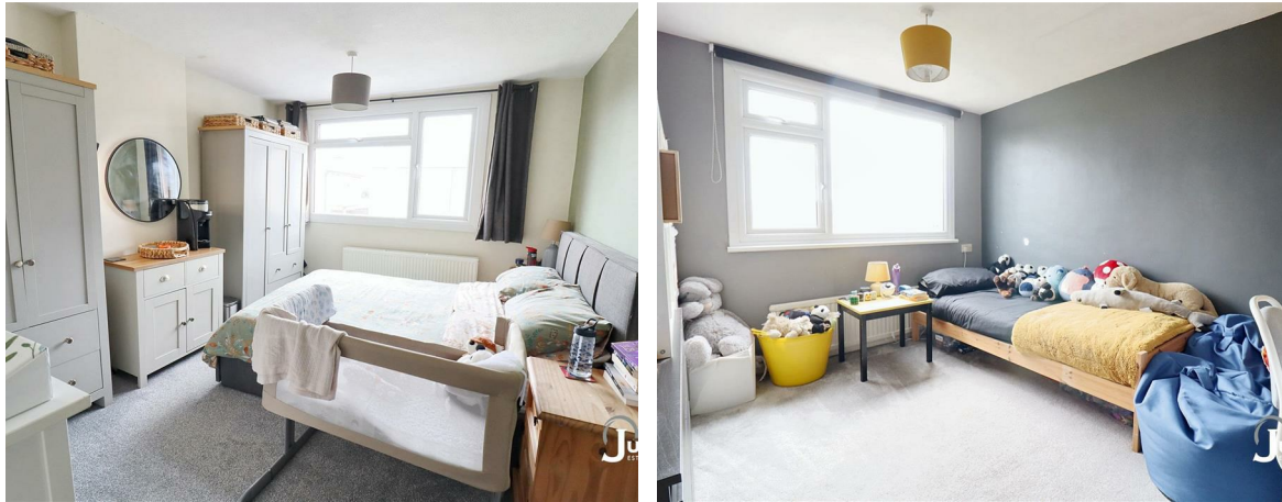
13 Cherry Tree Close